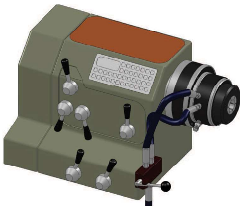
Applies: On Lathe

Collet provides the higher frequency to clamp, compare to 3-jaws chuck, collet chuck is up to save the time of clamping more than 75%. Any manufacturer whoever is paying attention to the cycle time, collet chuck is able to raise your output when you have the same time putting in.